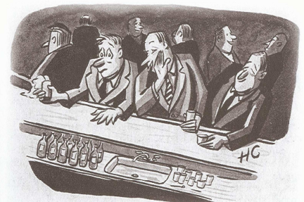
"That was a cute chick you married last night!"

An excerpt from "A Rabbit Walks into a Bar: Best Jokes & Cartoons from AA Grapevine"